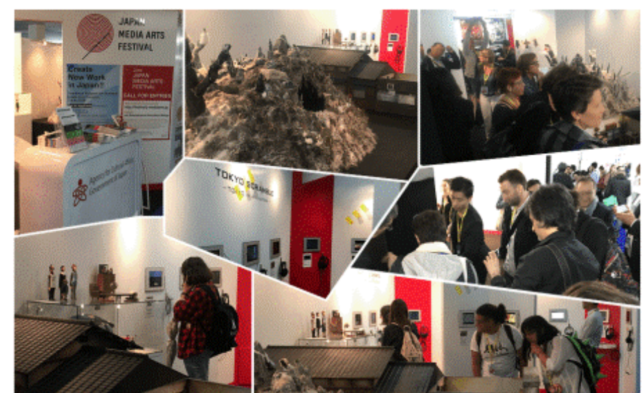
*2018 MIFA Japan Booth Display