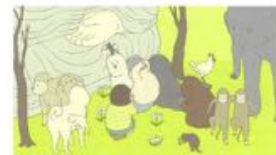
"My Exercise" © Atsushi Wada, New Dear 2018