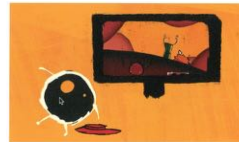
"Kaiju Engi" ©2018 Yosuke TANI