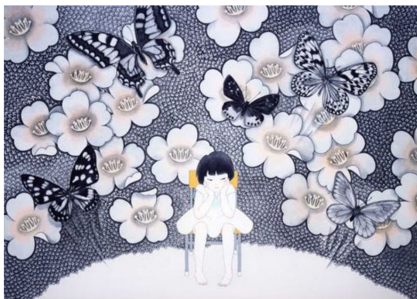
"Menstrual Flowers vol.4 Sign from Behind"

It will feature on posters, flags, large signs, and bus wrapping, infusing Annecy 2019 with Japanese color.