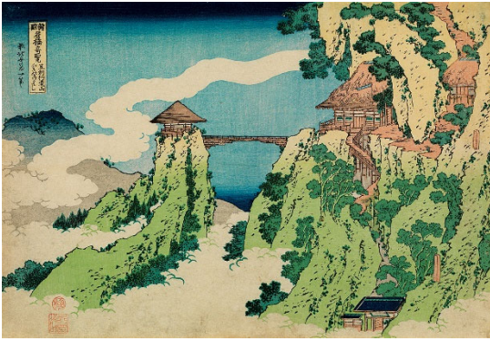
Katsushika Hokusai The Hanging-cloud Bridge at Mount Gyōdō near Ashikaga, from the series Remarkable Views of Bridges in Various Provinces The Sumida Hokusai Museum (2nd term)

葛飾北斎「諸国名橋奇覧 足利行道山くものかけはし」 すみだ北斎美術館蔵（後期） 天保5年（1834）頃 大判錦絵