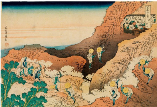
Katsushika Hokusai Pilgrims Climbing in the Mountain, from the series Thirty-six Views of Mount Fuji The Sumida Hokusai Museum (1st term)

葛飾北斎「富士三十六景 諸人登山」 すみだ北斎美術館蔵（前期） 天保2年（1831）頃 大判錦絵