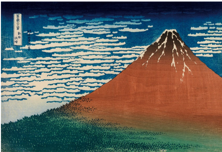
Katsushika Hokusai A Mild Breeze on a Fine Day, from the series Thirty-six Views of Mount Fuji The Sumida Hokusai Museum (Exhibit full-term with changes in works)

葛飾北斎「富嶽三十六景 凱風快晴」 すみだ北斎美術館蔵（作品を替えて通期展示） 天保2年（1831）頃 大判錦絵