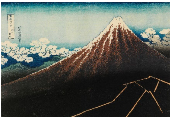
Katsushika Hokusai Rainstorm Beneath the Summit, from the series Thirty-six Views of Mount Fuji The Sumida Hokusai Museum (Exhibit full-term with changes in works)

葛飾北斎「富嶽三十六景 山下白雨」 すみだ北斎美術館蔵（作品を替えて通期展示） 天保2年（1831）頃 大判錦絵