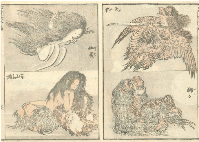
Katsushika Hokusai Tengu, Baboon, Ghost, Mountain Witch, from Sketches by Hokusai, Vol. 3 The Sumida Hokusai Museum (full term)

葛飾北斎『北斎漫画』三編 天狗 狒々 幽霊 山姥 すみだ北斎美術館蔵（通期） 文化12年（1815） 半紙本