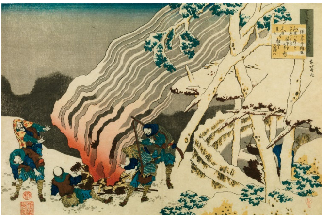
Katsushika Hokusai Minamoto no Muneyuki Ason, from the series One Hundred Poems Explained by a Nurse The Sumida Hokusai Museum (2nd term)

葛飾北斎「百人一首うはかゑるとき 源宗于朝臣」 すみだ北斎美術館蔵（後期） 天保6年（1835）頃 大判錦絵